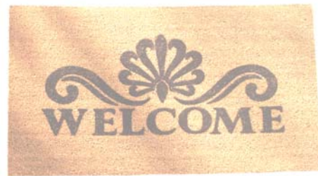
THE WELCOME MAT IS ALWAYS OUT!

I am pleased to report that staff, facilities, and Board member activity remain at a high level of capability and dedication. All licensees are to be commended and congratulated for their achievements and accomplishments. You and all interested members of the public are urged to come and visit the Board Office at any time to view these exhibits and facilities.